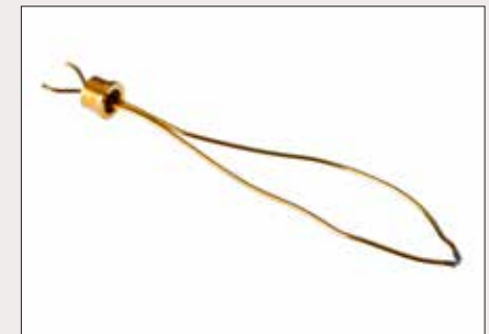
Manufacturing of temperature sensors (Illustration shows gilded platinum sensor)