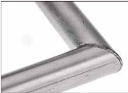
Weld seam for tube corner joint