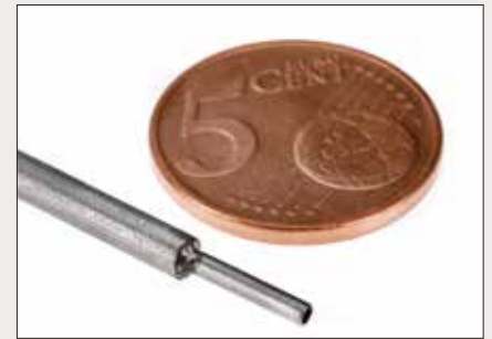
Tight welding of pressure lines