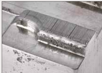
Weld cladding of edges