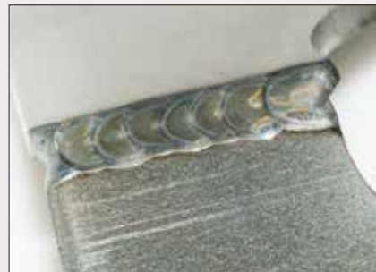
Welded joints of different materials